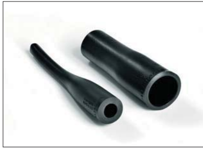
1751-1 supplied / fully recovered.

This style is ideally suited for shipboard and railway carriage cabling. The key features are: very robust, superior crush resistance and excellent strain relief. The wall thickness varies with long tail, allowing setting at varying angles through 90°.