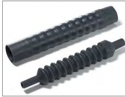
313C722-774 Series supplied / fully recovered.

The convoluted design provides the flexibility to accommodate different cable outlet angles.