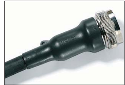
150 Series boot recovered onto a connector.