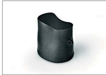
150 Series supplied.

This style is used in conjunction with a circular grooved adaptor, providing strain relief and enviromental sealing. For VG shapes with portholes "P" please refer to product standards tables in the appendix.