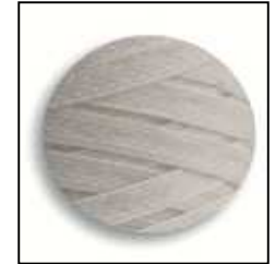
VIEW OF LACING TAPE ON REEL (FOR REFERENCE ONLY)