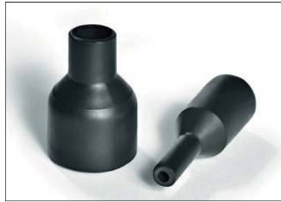
162-1-G supplied / fully recovered.

This style is a straight boot used for cable strain relief and environmental protection on many applications and is ideally suited where space is a premium.